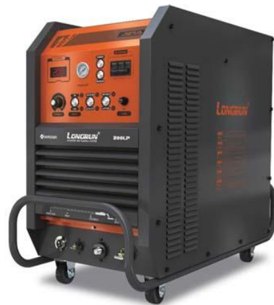
Model No. 200LP