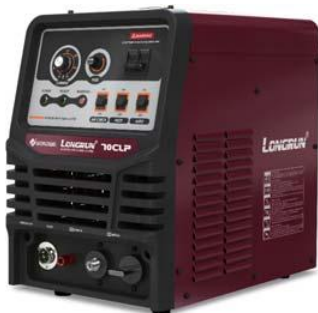
Built-in Compressor Model No. 70CLP