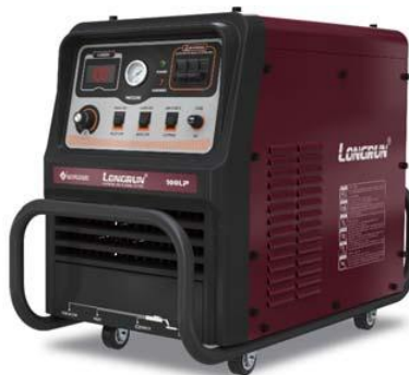
Model No. 100LP